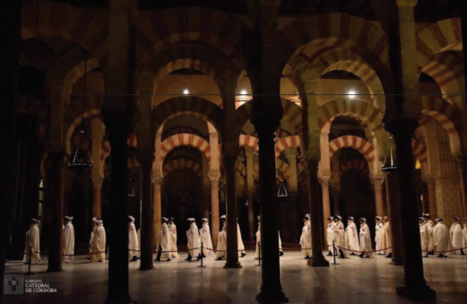
The Investiture ceremony of the Lieutenancy for Western Spain was held in the Cathedral of Cordoba.