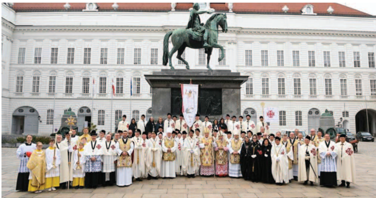
Numerous Lieutenancies were present at the Investiture ceremonies in Vienna.

dinner following the Investiture in Vienna, the Governor General recommended to those present to strengthen the Order's unity while respecting the diversity of traditions. The new Ritual, the commitment to greater spiritual involvement, the generosity towards the Mother Church of Jerusalem, must be shared by all the Lieutenancies, aware that together they