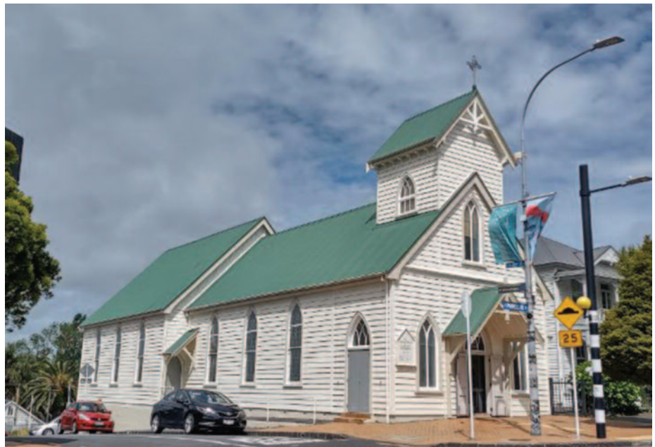
Bishop Pompallier, the first Bishop of Auckland, member of the Order of the Holy Sepulchre, inaugurated and blessed the church of St. John the Baptist in Parnell, a central area of the city, which has become the Order's patronal church in New Zealand.

The church, initially a small timber building with a tower and spire, was opened and blessed on 12 May 1861 by Bishop Pompallier. It took its current form when it was enlarged with the addition of the extended East end in 1899. The sanctuary was reordered in 1931 with a design that largely remains to this day. Franciscan and Marist communities administered the Parish of Parnell until 1989 when the parish reverted to diocesan status. In 1997 the church was completely refurbished.