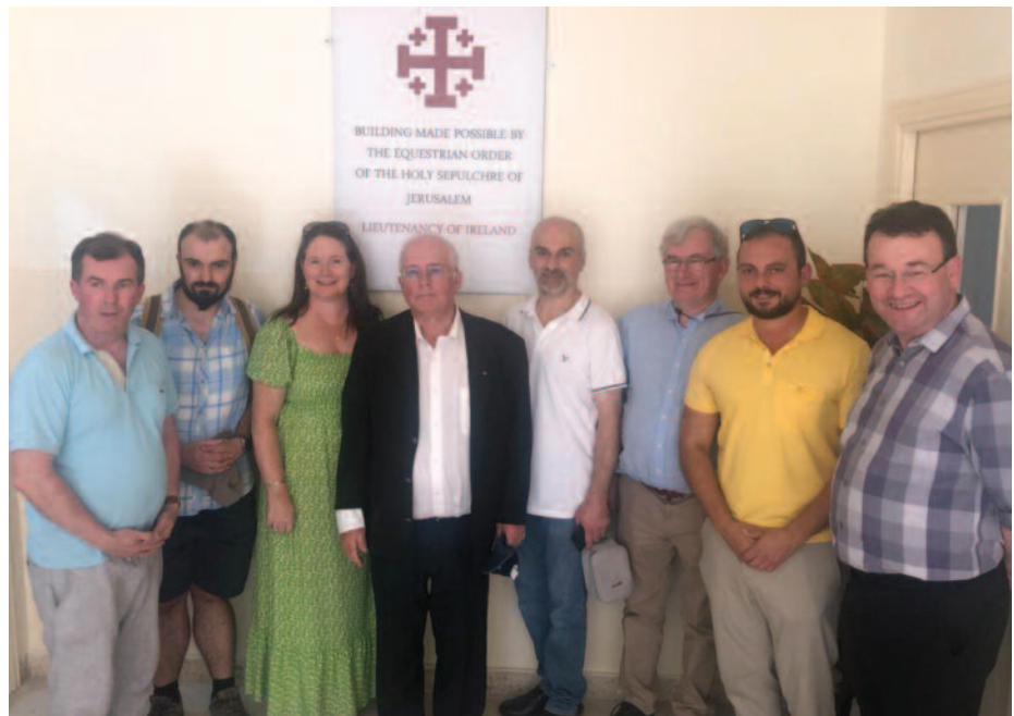
The pilgrimage of the Irish Knights and Dames included a visit to the parishes of Taybeh in Palestine and Mafraq in Jordan, where the Order's Lieutenancy for Ireland funded small projects, developing a bond of friendship with the local communities.

In Taybeh, the last remaining entirely Christian town in Palestine, we visited the Beit Afram Home for the Elderly, managed by the Servants of the Lord and the Virgin of Matara. Our Lieutenancy donated a substantial sum to finance urgently needed