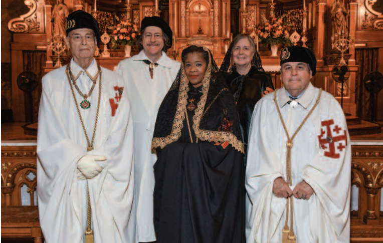
Lieutenant General Agostino Borromeo represented the Grand Magisterium in Chicago.