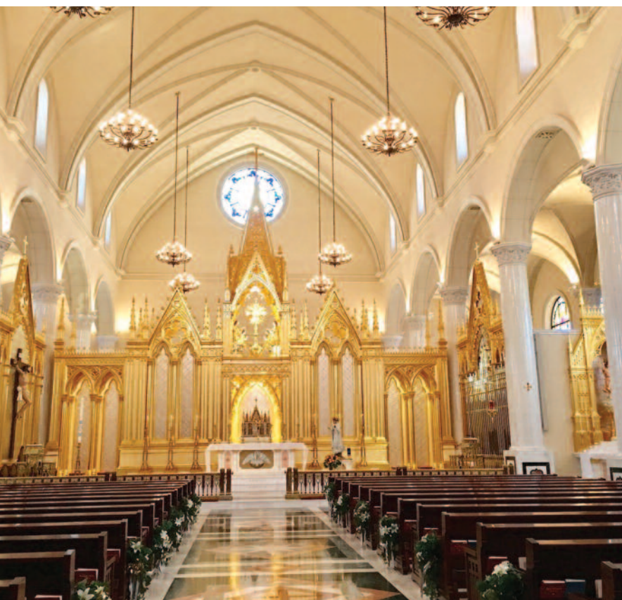
Members from all over North America participated in a pilgrimage dedicated to Our Lady of Palestine at the Shrine of the Blessed Sacrament founded by Mother Angelica in Hanceville, Alabama.