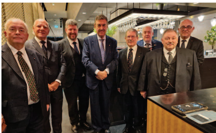
The Lieutenants and Magistral Delegates from the English-speaking countries (England and Wales, Scotland, Ireland, Gibraltar and Southern Africa) met with the Governor General in London on the side-lines of the Investiture ceremonies.

ceremonies which took place at St. George's Cathedral in Southwark. The Prayer Vigil was officiated by the Grand Prior, Archbishop John Wilson, Archbishop of Southwark, and the Investiture itself, the following day, by Cardinal Fernando Filoni, Grand Master, who welcomed 12 new members to the Order. A solemn banquet followed at the Mansion House, official residence of the Mayor of the City of London. During the banquet in the Egyptian Room of the Mansion House, the speeches emphasised the unity of the Order in its various peripheral articulations and the uniqueness of its commitment to the Holy Land.