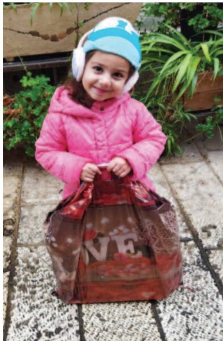
The Order of the Holy Sepulchre also contributes to the purchase of gifts for children in the Holy Land whose families are in difficulty.