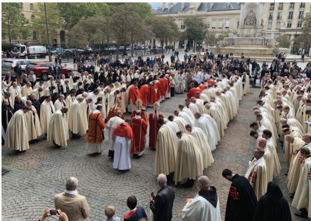
Numerous Knights and Dames attended the Investiture Ceremony of the new members of the Lieutenancy for France and the Lieutenancy for Luxembourg in the church of Saint-Sulpice, in Paris.

The Lieutenancy for France organised the gala evening in the prestigious Cercle des Armées, which was attended by all the new members of the Order. The Archbishop of Paris, Msgr. Laurent Ulrich, and the Grand Chancellor of the Legion of Honour honoured the Order with their presence.