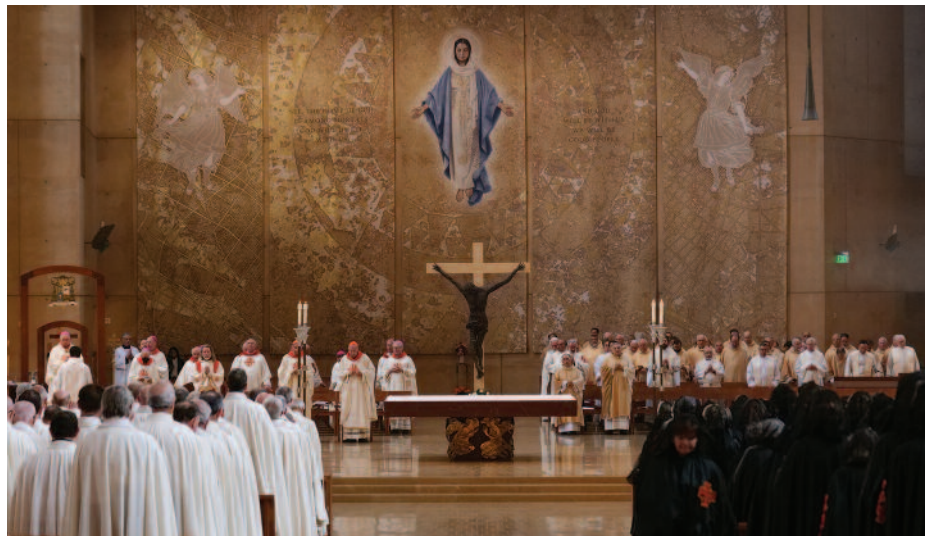
Investiture ceremony at the Church of Our Lady of the Angels in Los Angeles, California.