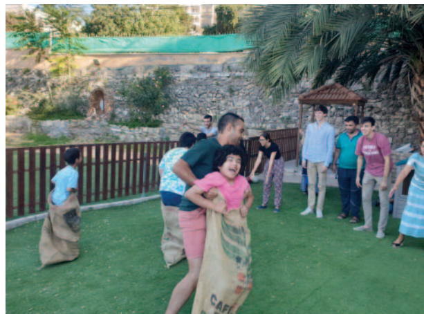
Young people organised by the Lieutenancy for Western Spain were able to take part in several services in the Holy Land, particularly with disabled children.