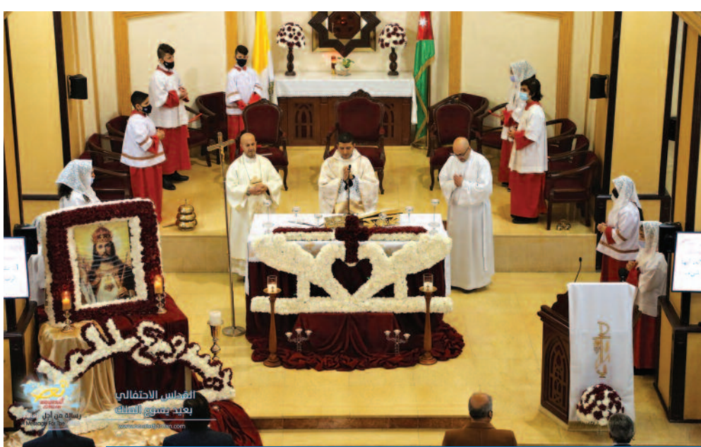
In Misdar, one of the poorest districts of Amman, Jordan, the parish has grown considerably over the years. The Order has taken over the work in the Church of Christ the King.

Patriarchate was able to create a pastoral environment suitable for living, praying and participating in masses and parish events.