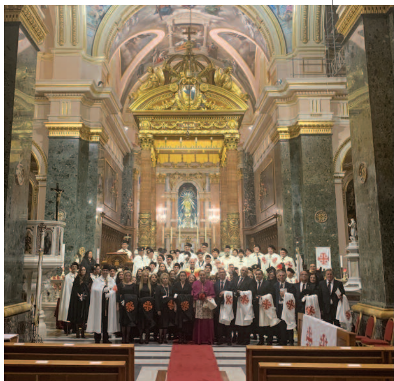
The Vigil and the Investiture Ceremony of the Maltese Lieutenancy took place respectively in the Basilica of the Nativity of Mary in Senglea (in our photo) and in the Metropolitan Cathedral of St. Paul in Mdina.